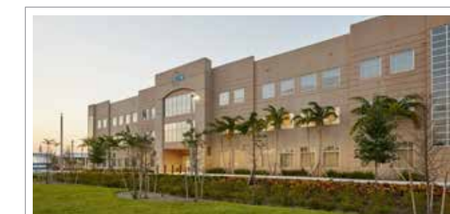
TRI-RAIL | Tri-County Area, FL