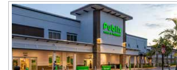
MONARCH TOWN CENTER | Miramar, FL