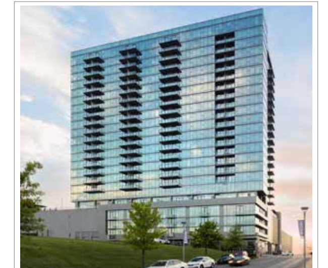
TWELVE | TWELVE | Nashville, TN