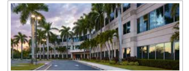
SUNRISE CORPORATE PLAZA | Sunrise, FL