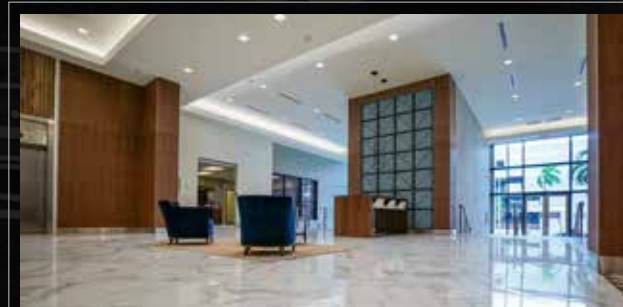
110 EAST BROWARD | Fort Lauderdale, FL