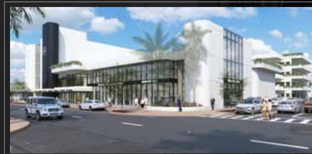
USSERY MERCEDEZ BENZ | Coral Gables, FL

Stiles Tenant Project Management bridges the gap between development, leasing, property management, construction & design. With one of the most experienced tenant improvement teams in the Southeast, we provide a full range of tenant improvement services from start to finish for both large and small firms.