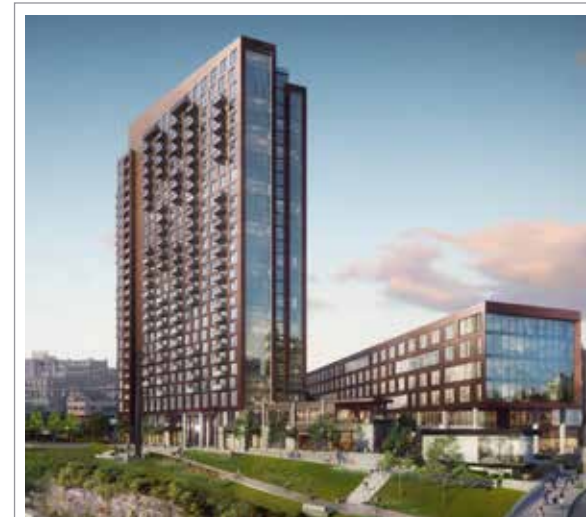
PEABODY UNION | Nashville, TN