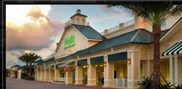
SHOPPES AT VERANDA FALLS | Port St. Lucie, FL