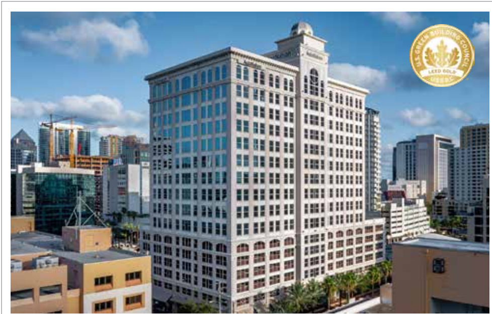
THE AUTONATION BUILDING | Fort Lauderdale, FL