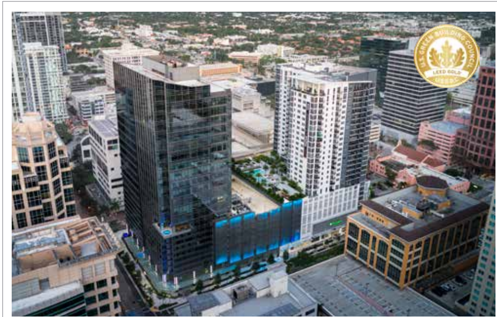
THE MAIN LAS OLAS | Fort Lauderdale, FL