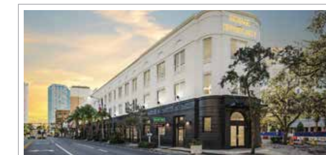
442 WEST KENNEDY | Tampa, FL

Leveraging Stiles’ more than half-century of experience as an owner, we have developed proven strategies that focus on reaching the owner’s objectives. From stabilizing assets to increasing their value, Stiles understands that quality management is integral to unlocking a property’s full potential. This philosophy has led to our unparalleled reputation while establishing Stiles as a recognized leader in the real estate market.