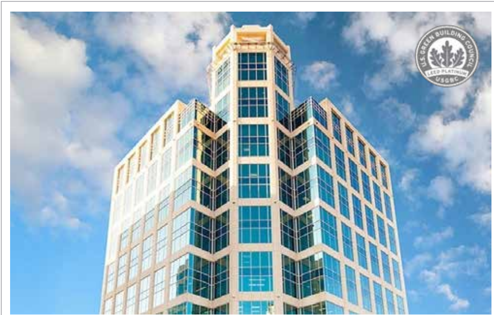
200 East Las Olas | Fort Lauderdale,