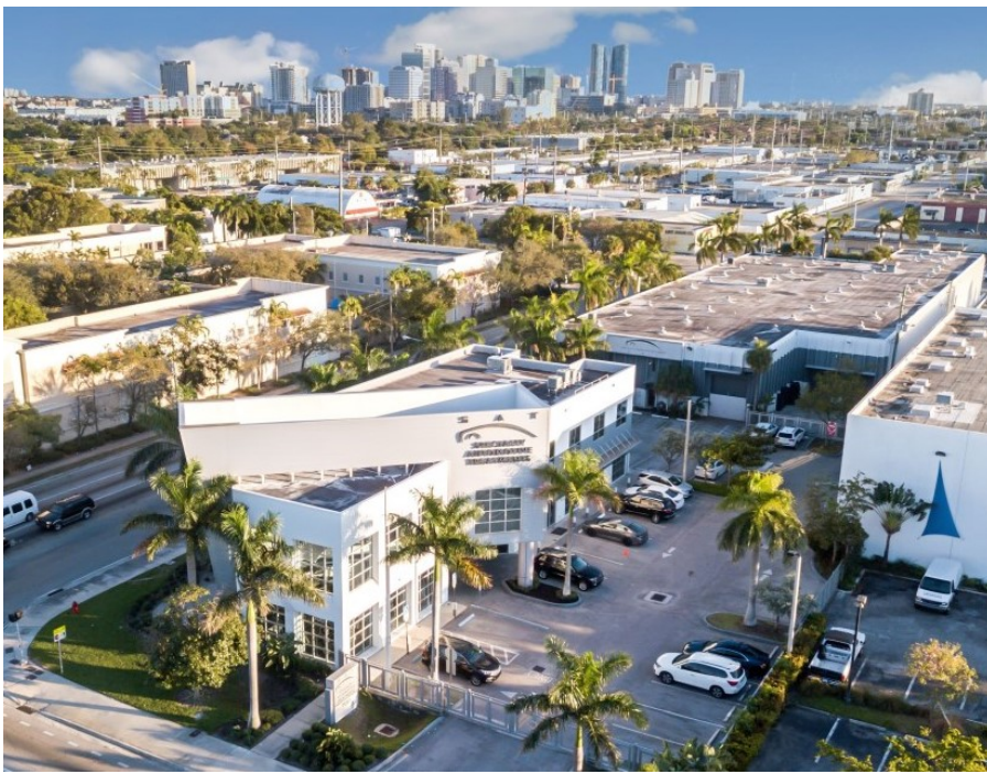
700 W Sunrise Blvd

“The East Sunrise market is showing incredible strength right now due to its prime location just north of downtown, excellent demographics and easy access to I-95,” Pace said.