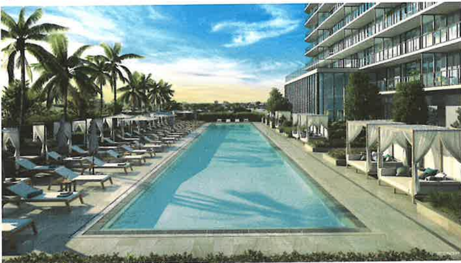
72 Park.