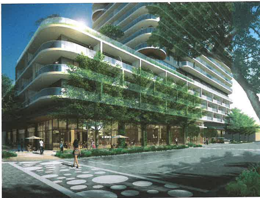
72 Park.