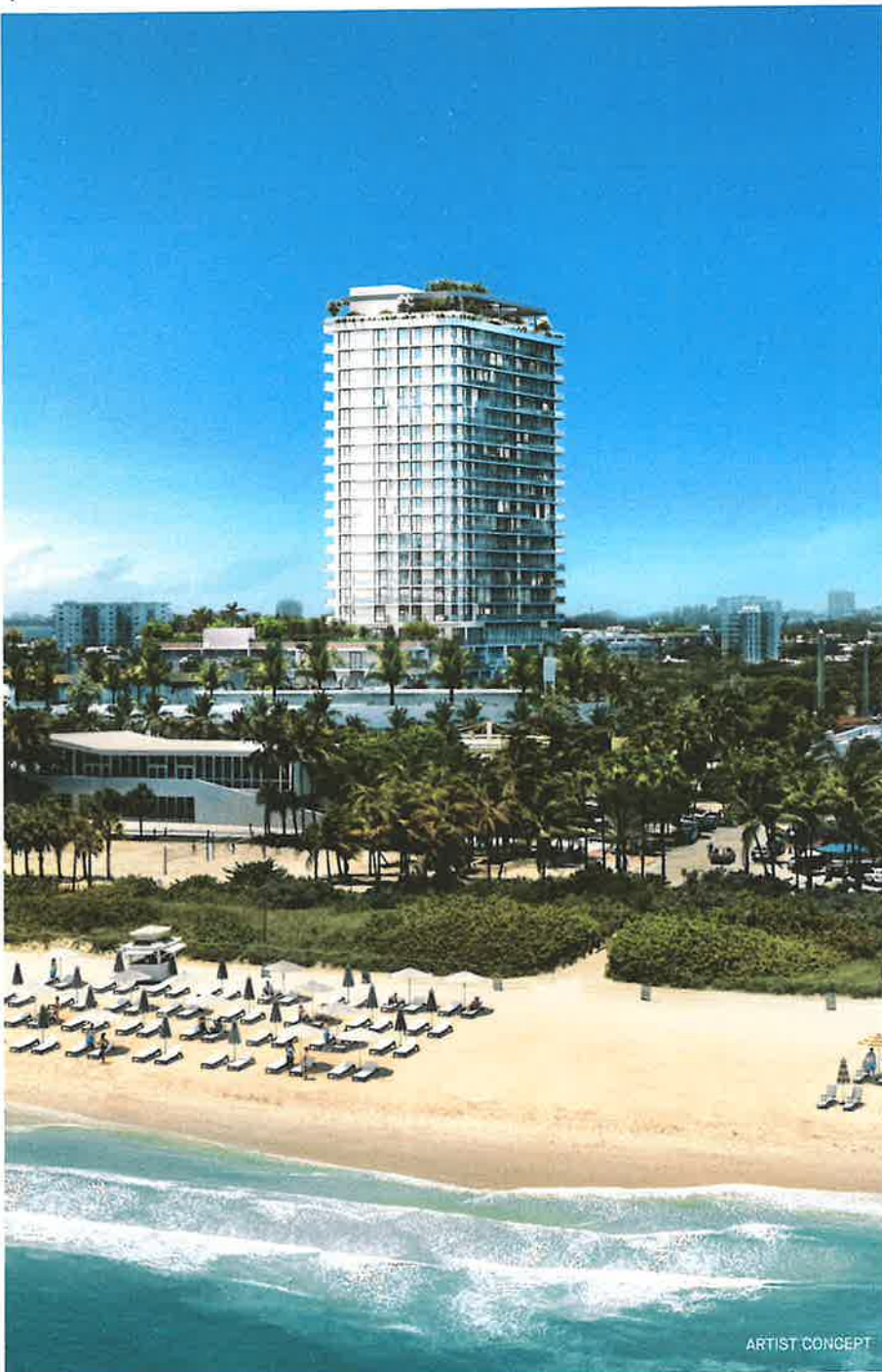
72 Park. Credit: Lefferts.

Cervera Real Estate serves as the exclusive sales team. Available inventory starts at the $700,000s.