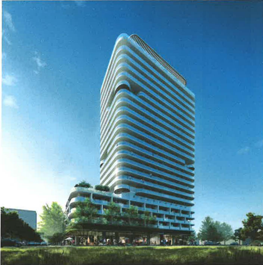
72 Park.

BY: OSCAR NUNEZ 8:00 AM ON SEPTEMBER 21, 2023